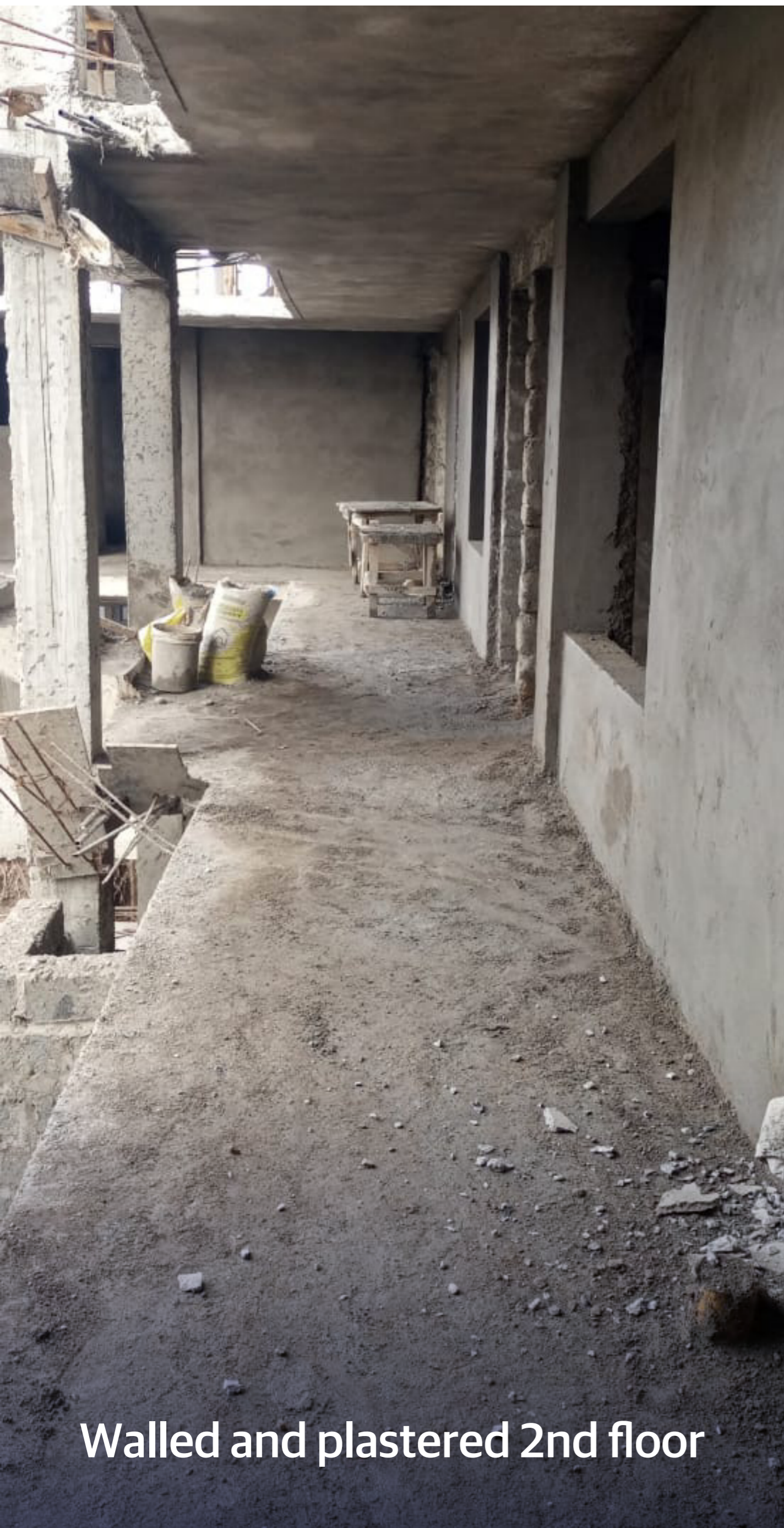
Walled and plastered 2nd floor