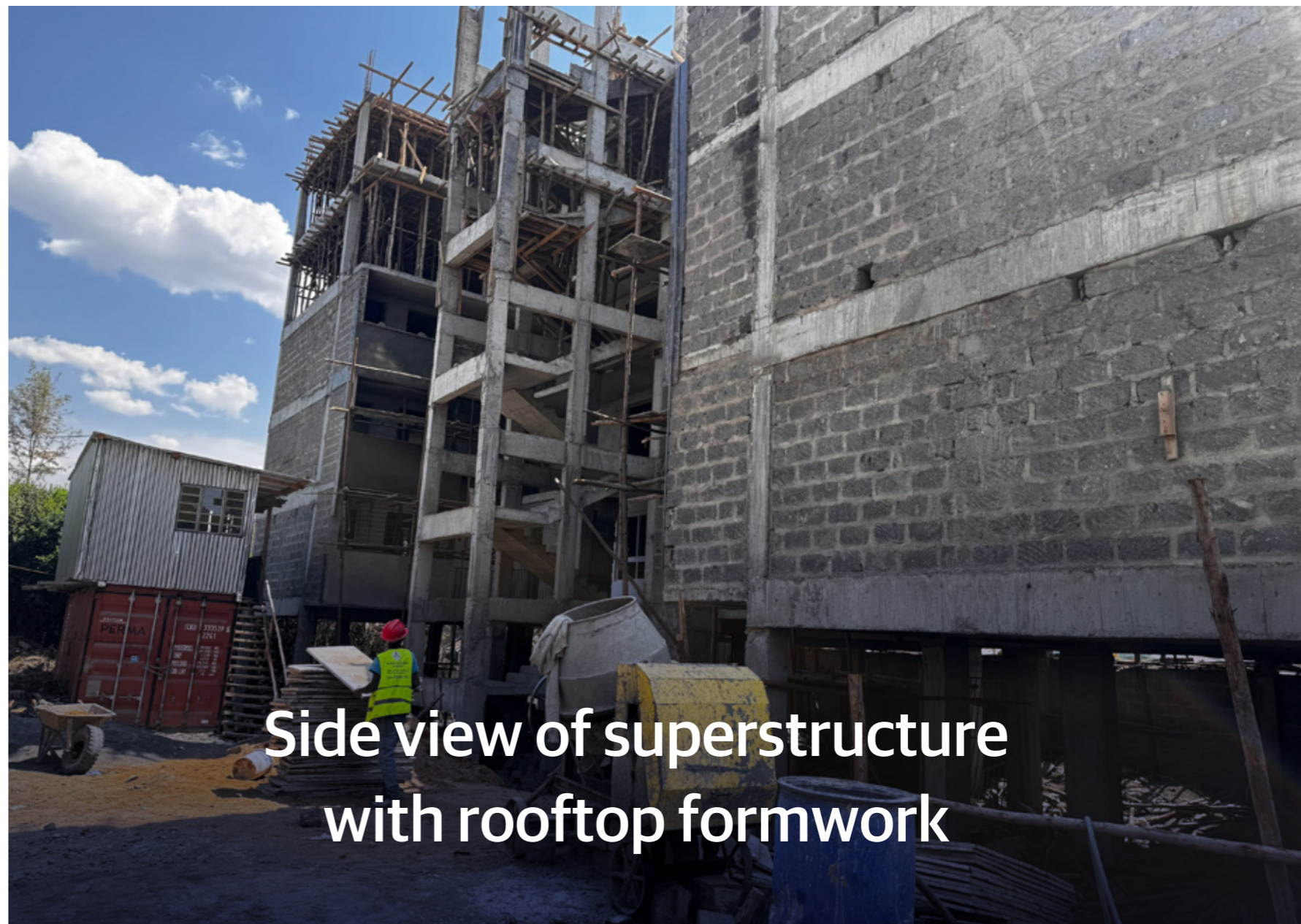
Side view of superstructure with rooftop formwork