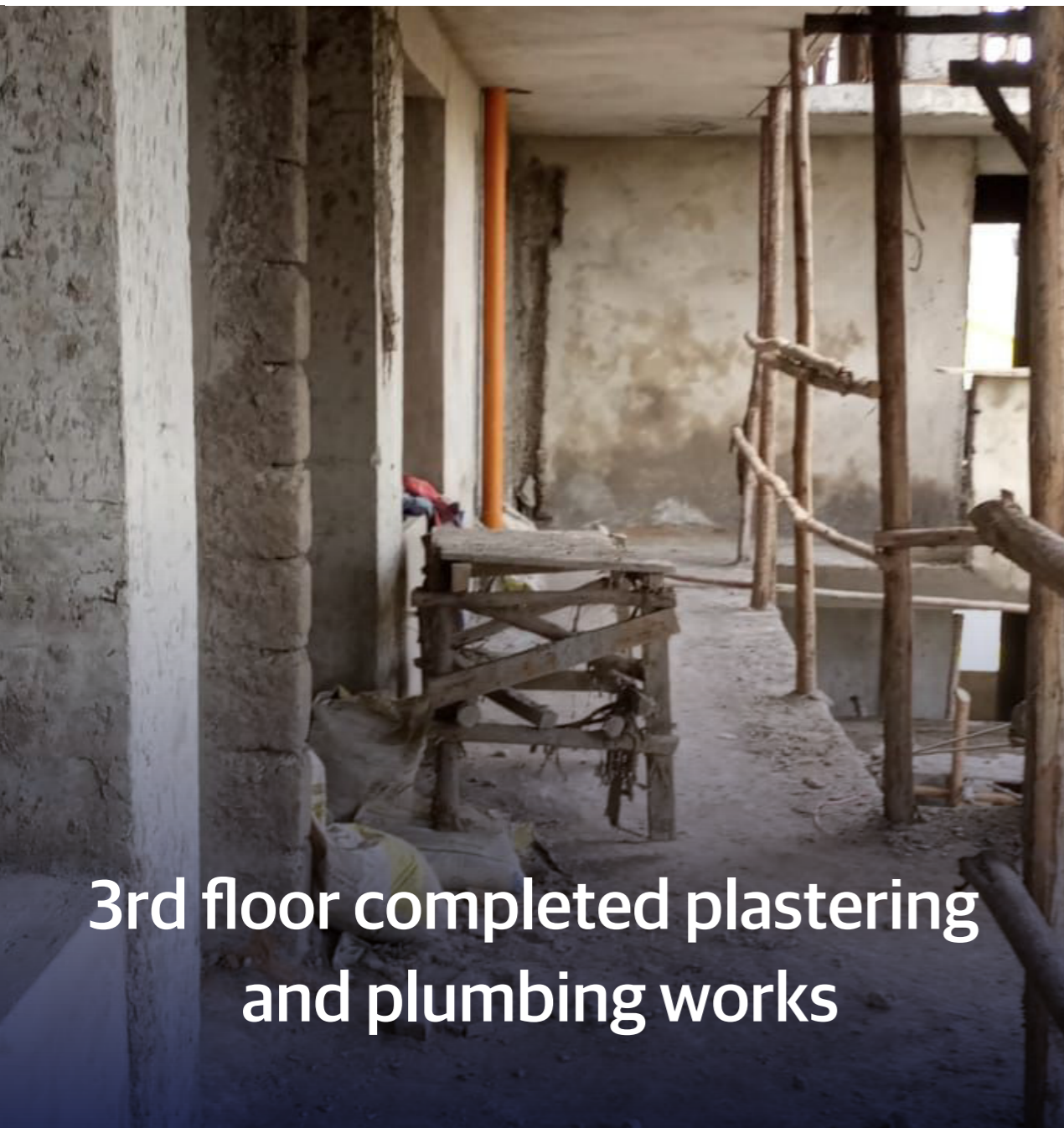
3rd floor completed plastering and plumbing works