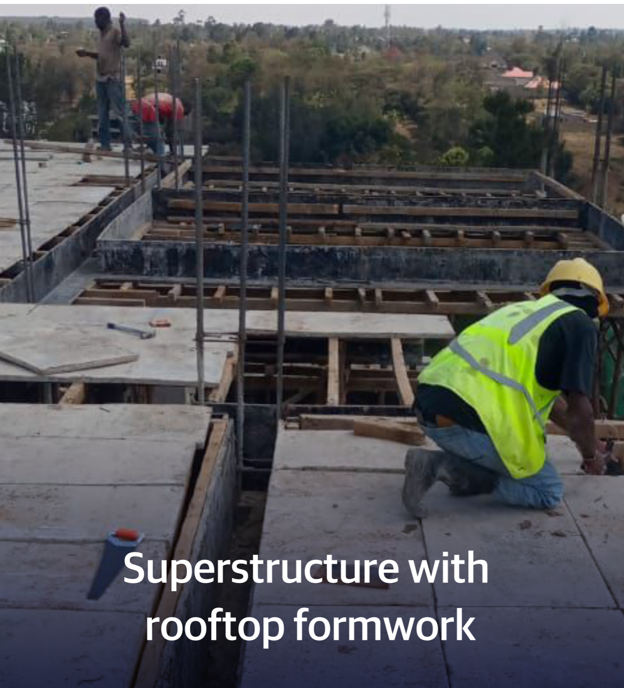
Superstructure with rooftop formwork