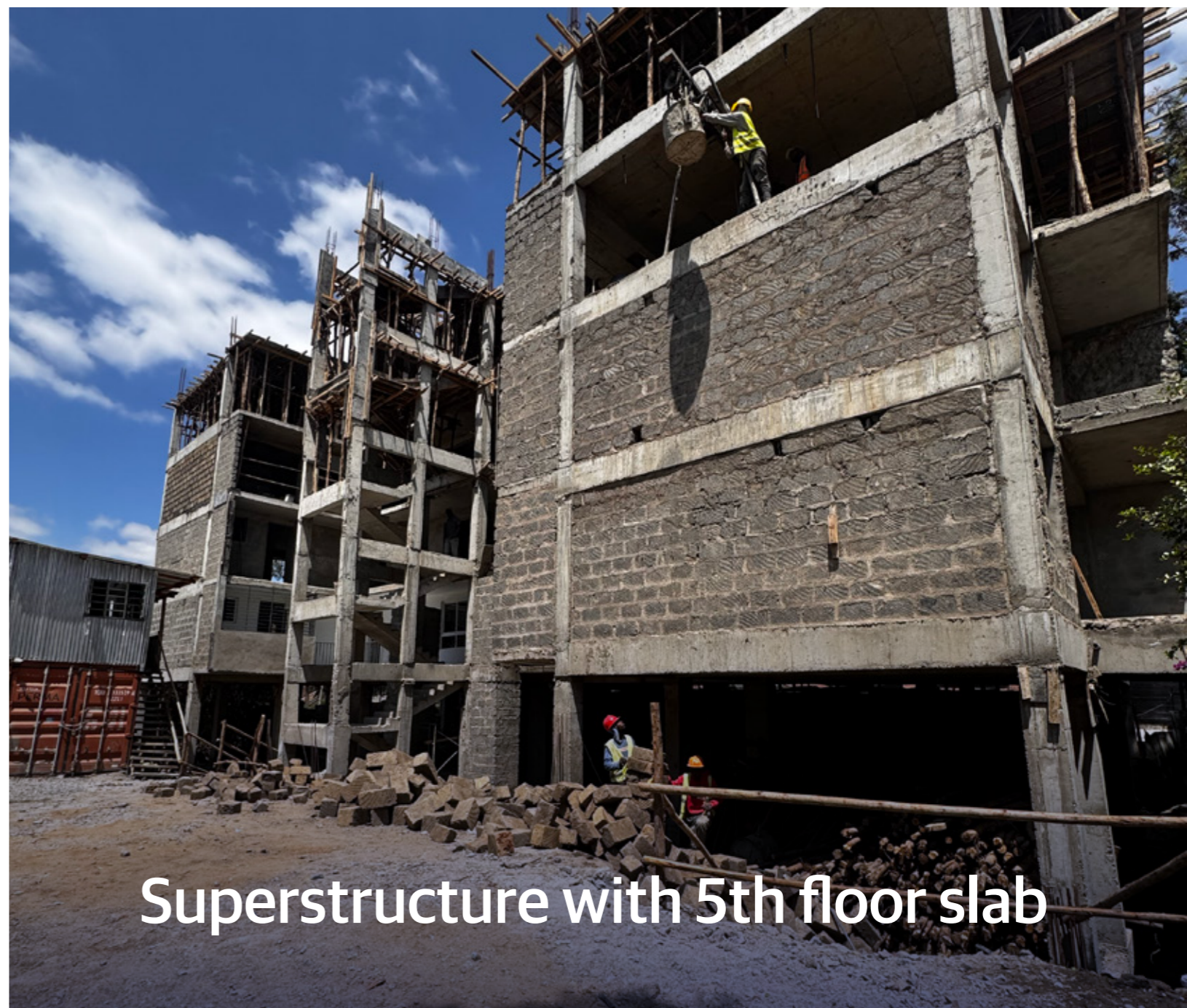
Superstructure with 5th floor slab