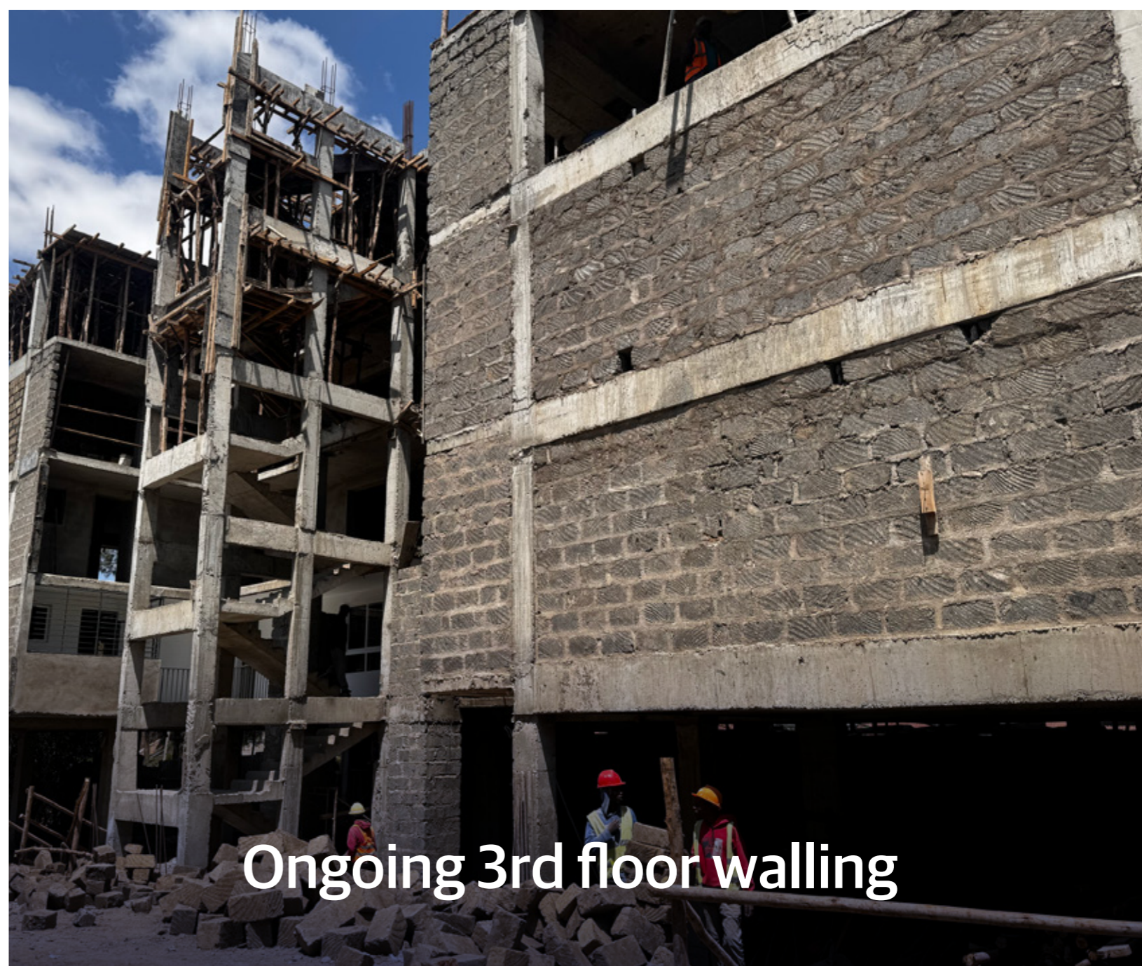
Ongoing 3rd floor walling