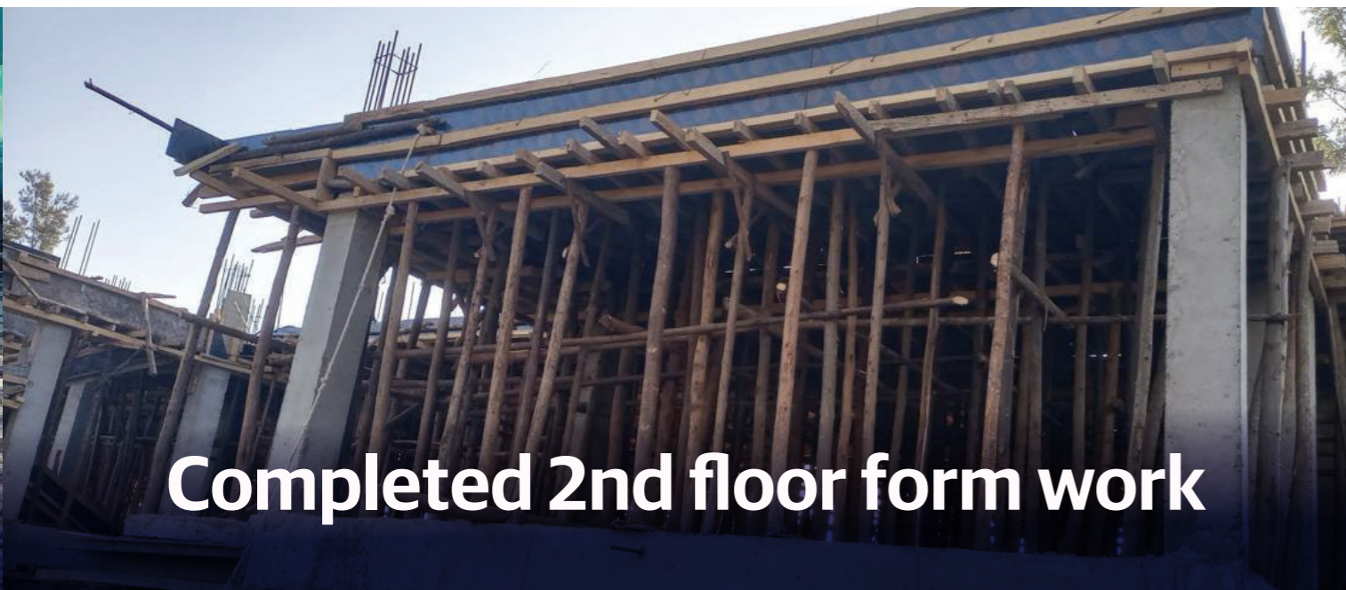
Completed 2nd floor form work