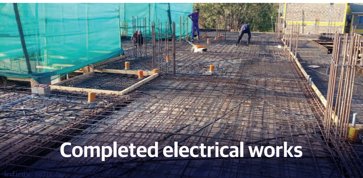
Completed electrical works