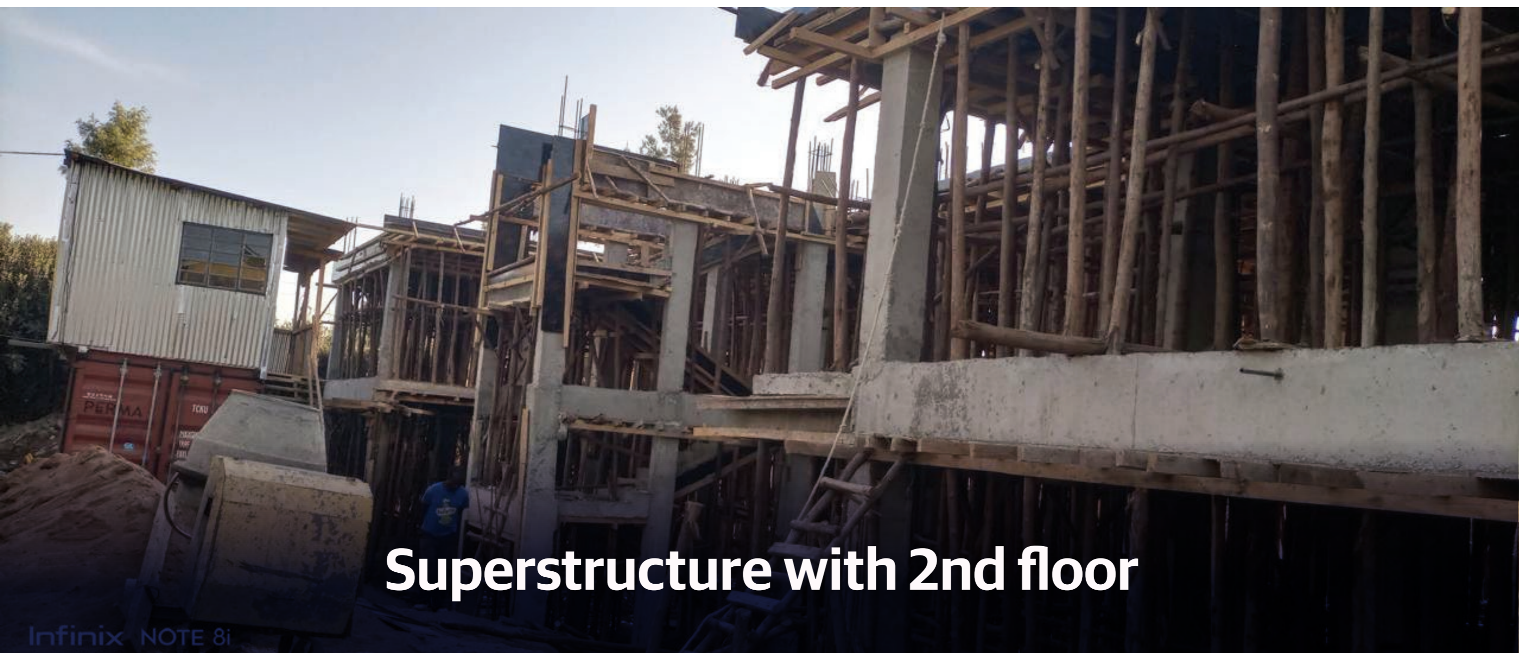
Superstructure with 2nd floor