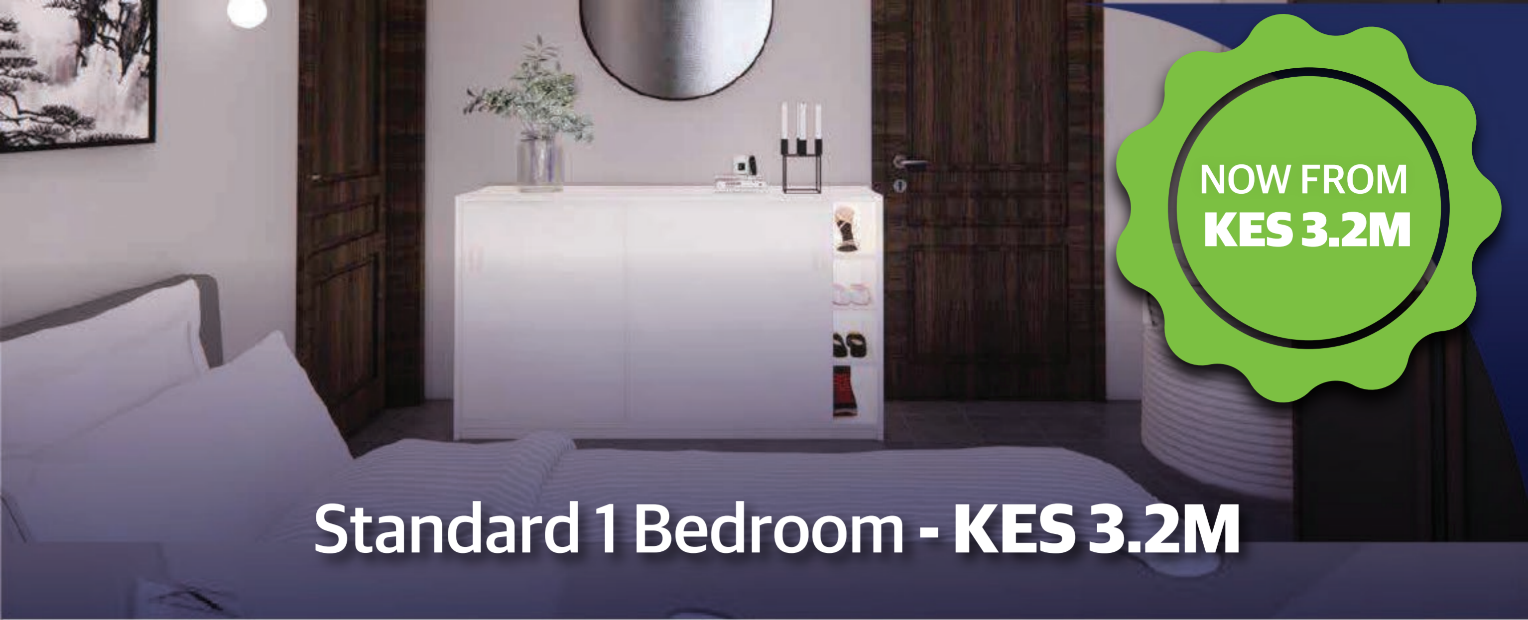
Standard 1 Bedroom - KES 3.2M