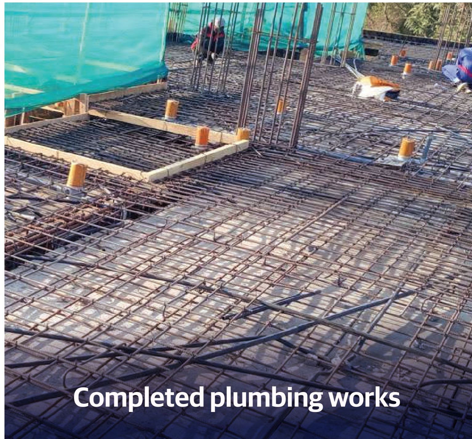
Completed plumbing works